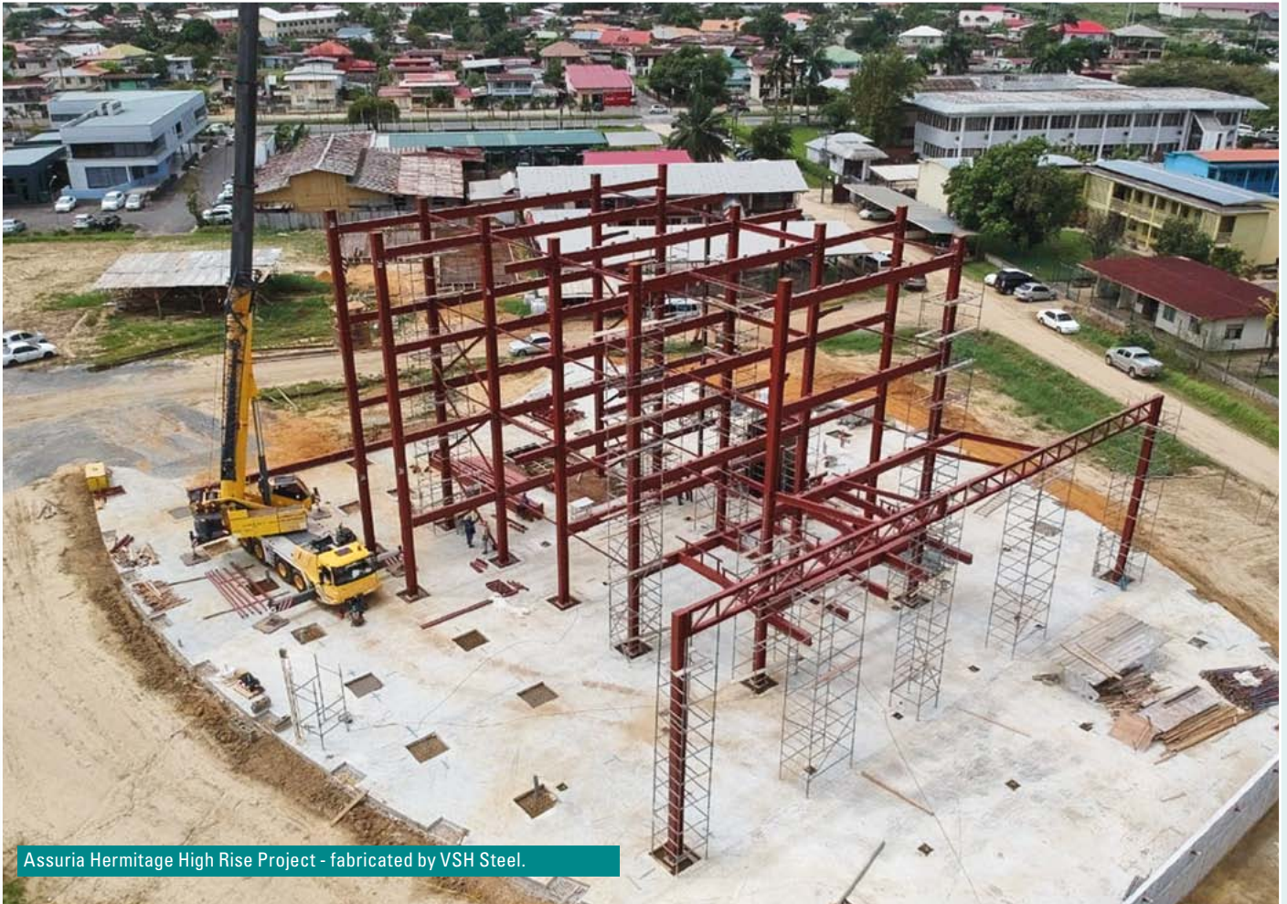
Assuria Hermitage High Rise Project - fabricated by VSH Steel.