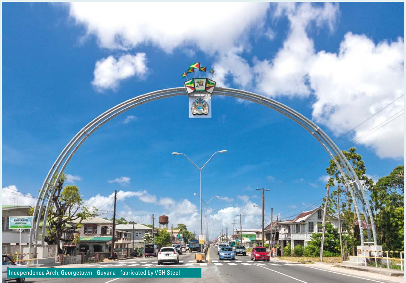
Independence Arch, Georgetown - Guyana - fabricated by VSH Steel