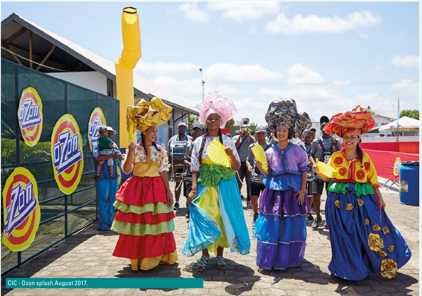
CIC - Ozon splash August 2017.