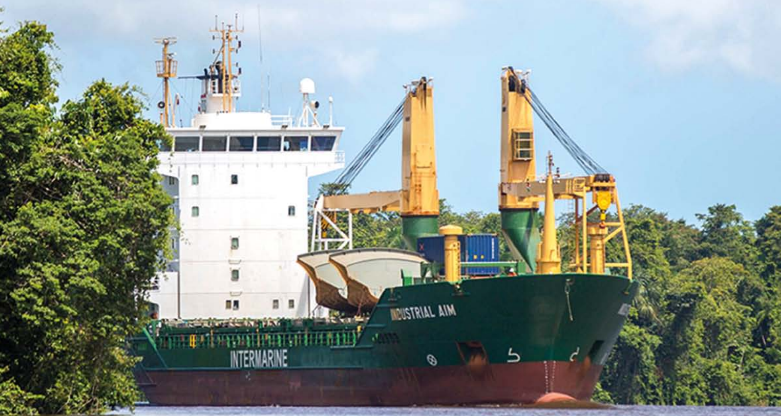
Intermarine vessel Industrial Aim carrying cargo for Newmont to Moengo Port (Traymore N.V.)